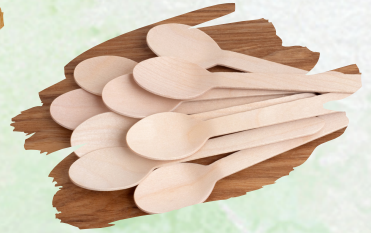
Pencils, sticks or wooden spoons