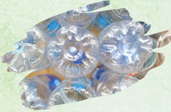
A clean plastic bottle, crisp tube, milk bottle or juice carton