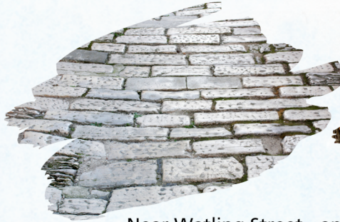
Near Watling Street - an important Roman Road