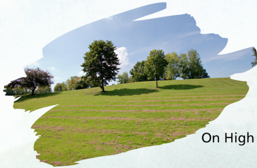
On High ground