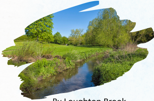
By Loughton Brook

3. Look at the images below. Discuss why each of these would have helped people to live at Bancroft.