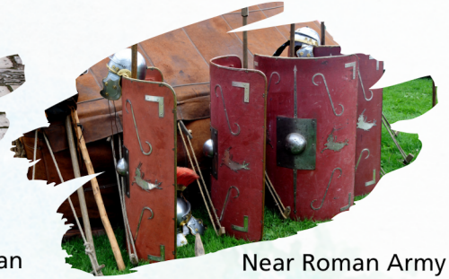
Near Roman Army Camps