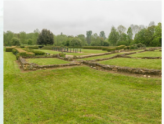
Illustration Copyright 2023 Chiba Creative

The villa was built during the Roman period. The Romans invaded in 43 CE and ruled until around 400 CE. The Roman soldiers did not live in the villa but lived in army camps nearby, at Towcester and near Fenny Stratford. The villa would have been owned by a rich local who traded or cooperated with the Romans. The building you can see on site was built in 340 CE.