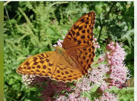
Silver Washed Fritillary