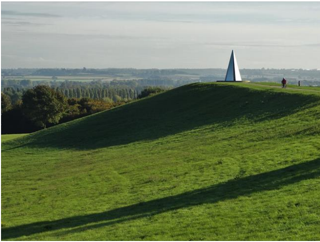
The Light Pyramid on The Belvedere at Milton Keynes