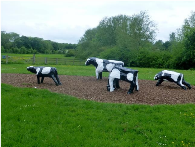
Concrete Cows