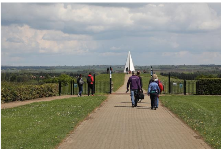
Path to the Light Pyramid